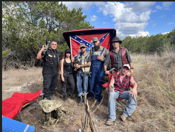
A moment of truce between the Rednecks and the mercenaries. It wouldn't last.