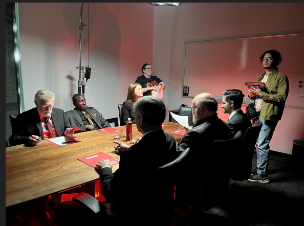
Prepping for the opening scene of the film.