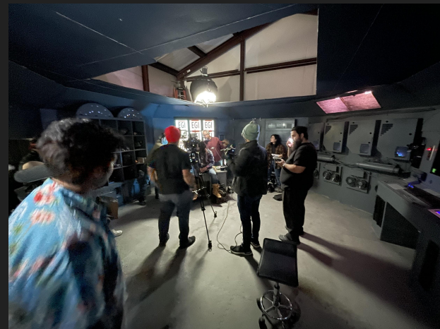
On set in San Marcos at Buffalo Productions Studios.